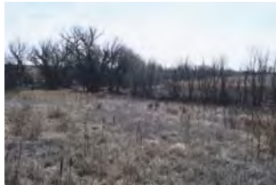
Tract 1: Cropland / Expired C.R.P. and Tree Cover

MANNER OF SALE: Tracts to sell individually