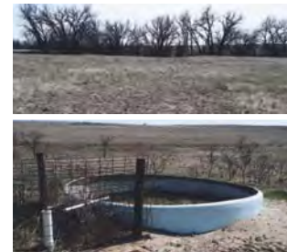
Tract 4: Bottom Land Cultivation, Tree Cover and Water Well

AGENCY DISCLOSURE: Farmland Auction & Realty Co., Inc. is the agent for the Seller. If purchaser desires representation, legal counsel is advised.